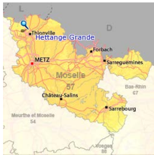
Plan de la Ville de Hettange-Grande/Sœttrich